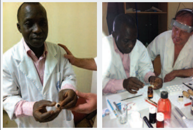
Figure 2: The first ocular prosthesis being performed in Bamako, Mali

attended by the press. During this visit, after two days of training, the first ocular prosthesis was carried out at IOTA (Figure 1).